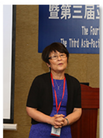
Fig11.Prof.Nichle Hesselbrock in concurrent session(April 25)