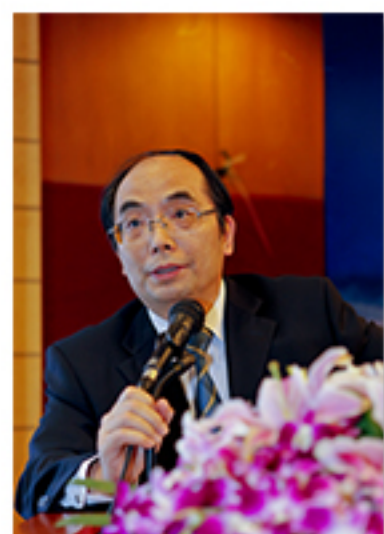
Fig3.Prof Wei Hao>Welcome from Conference Committee(April 25)