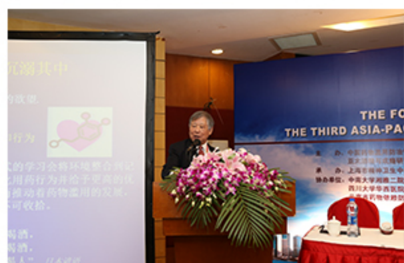
Fig 10.Plenary lecture by Prof Walter Ling(April 25)