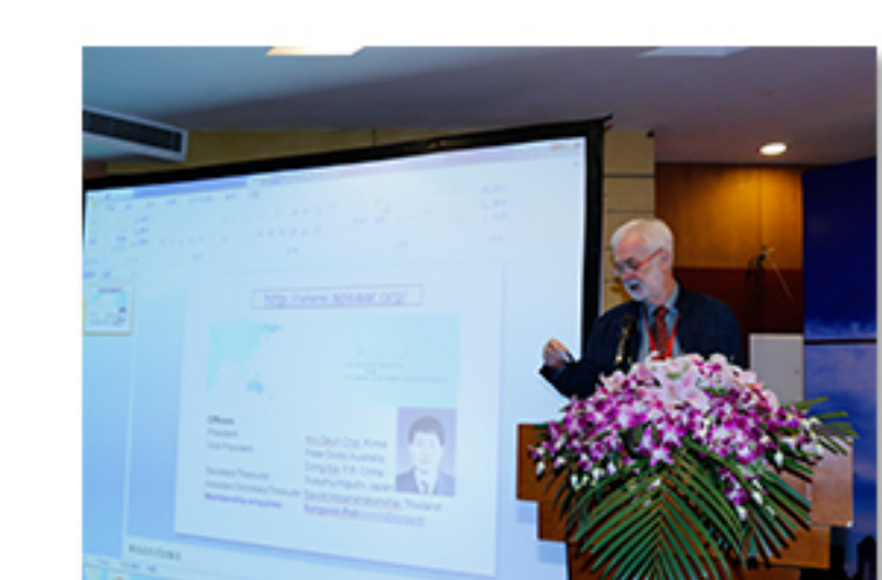
Fig21.Plenary lecture by Prof.Peter Dodd(April 26)