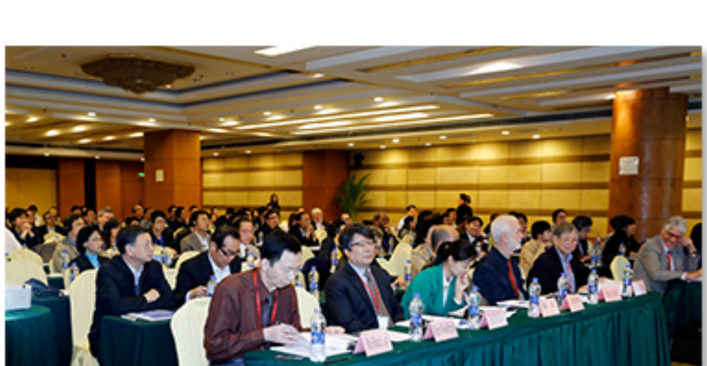
Fig23.Plenary lecture(April 26)