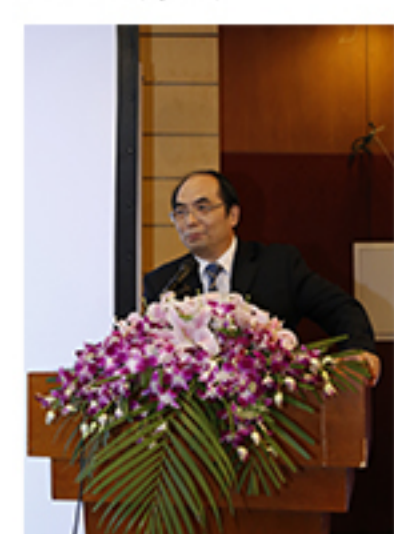
Fig8.Plenary lecture by Prof.Wei Hao (April 25)