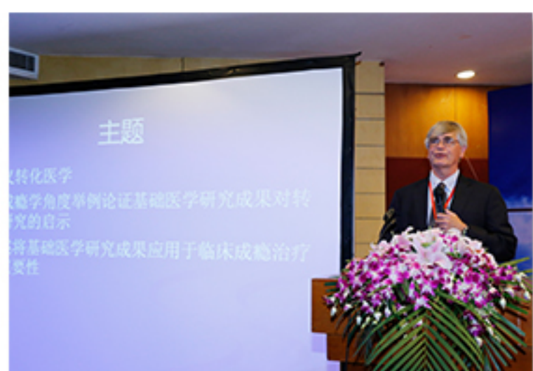
Fig13.Plenary lecture by Prof.Victor Hesselbrock(April 26)