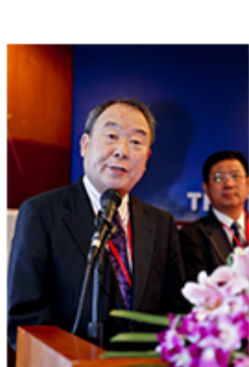
Fig22.Prof.Susumu Higuchi close address from APSAAR(April 26)