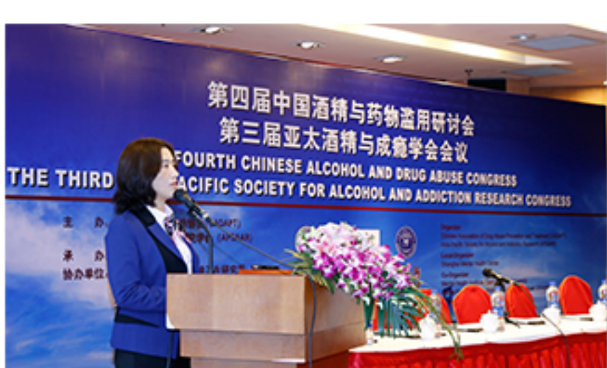
Fig18.Plenary lecture by Prof.Min Zhao(April 26)