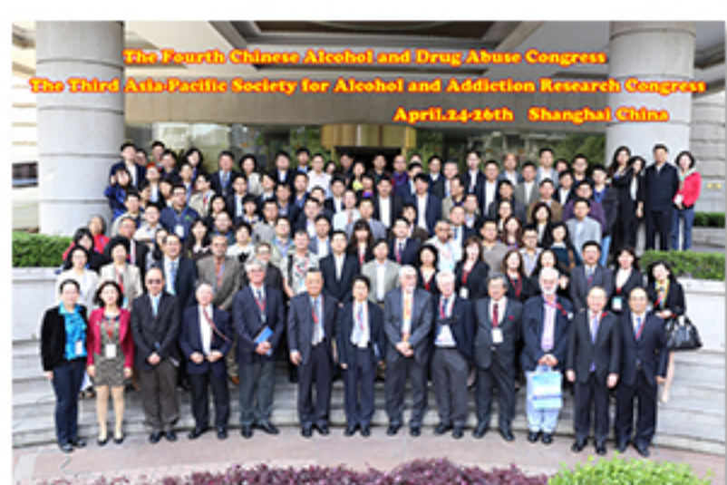
Fig6.The photograph of all participants