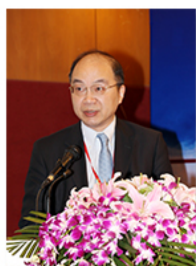
Fig4.Prof Yifeng Xu>Welcome from local organizer(April 25)