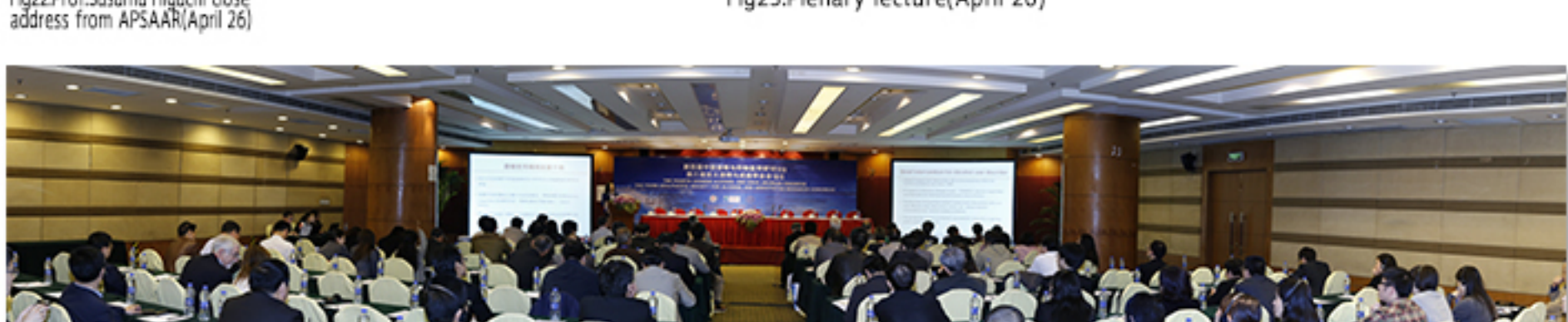
Fig24.Plenary lecture(April 26)