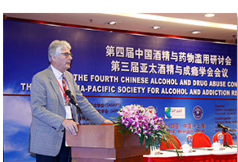
Fig20. Plenary lecture by Prof.Chris Chapleo(April 26)