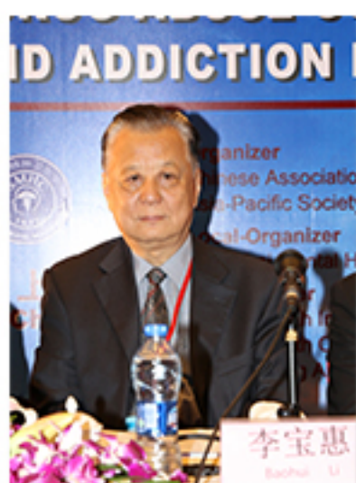
Fig5.Prof Baohui Li>Welcome from CADAPT(April 25)