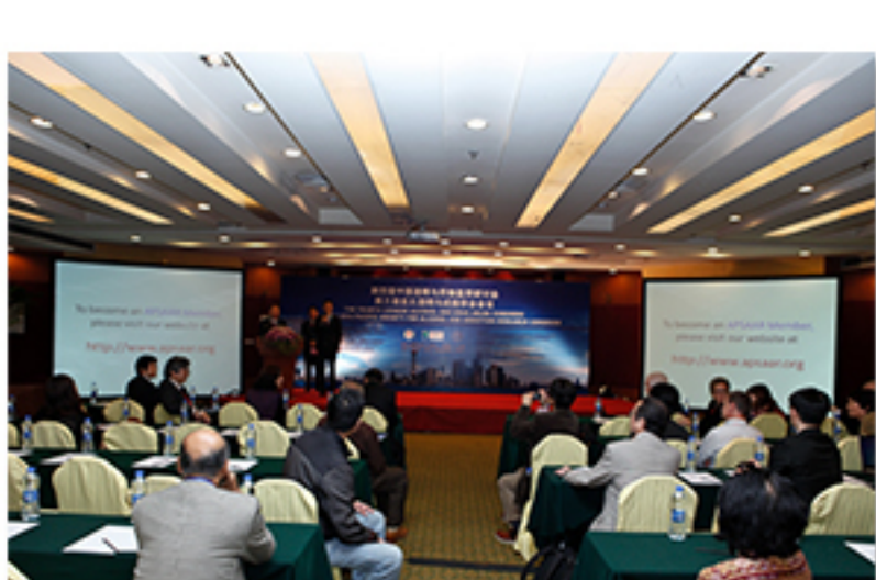
Fig25.Close ceremony(April 26)