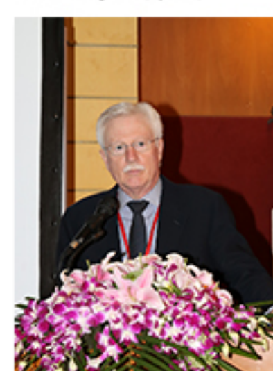
Fig7.Plenary lecture by Prof.George Koob(April 25)