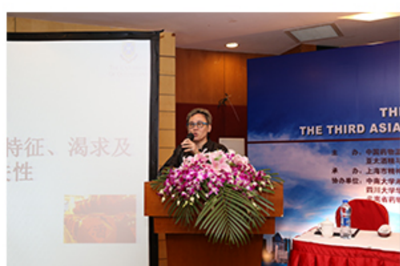
Fig9.Plenary lecture by Prof.Alfreda Stadlin(April 25)