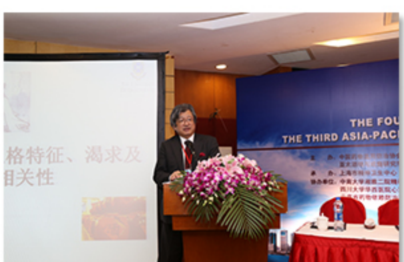
Fig16.Plenary lecture by Prof.Toshikazu Saito(April 25)